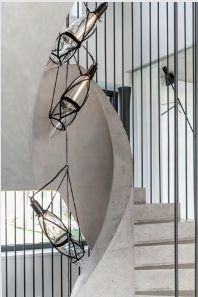
Tim Collection, Germany, BMK Yachthafen