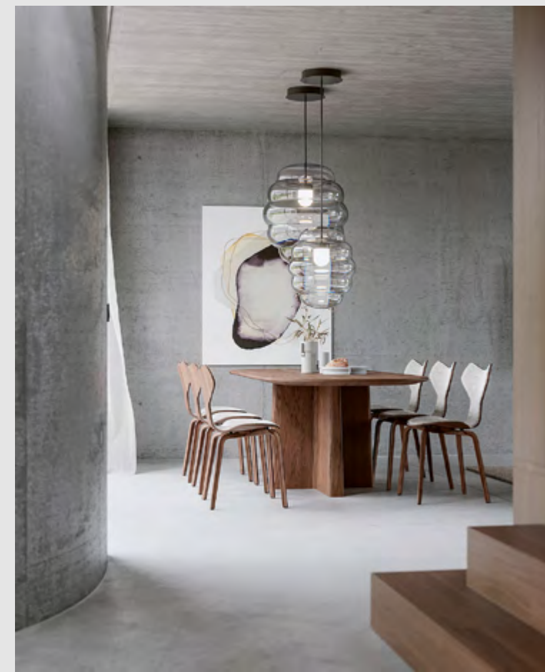
Pyrite Collection, Norway, Interior by Aparta Interior in cooperation with LHM Group