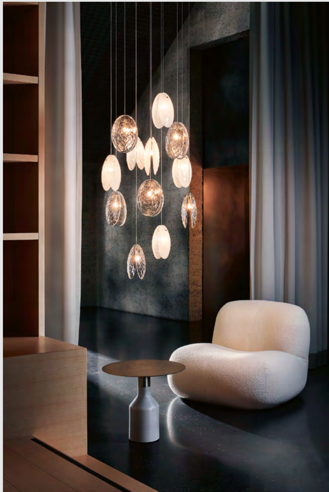
Mussels Collection installation of 12 pieces, Czechia, Kunsthalle Prague