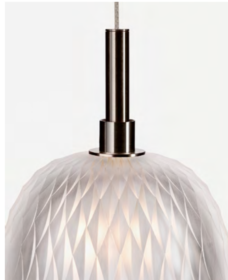
Glass Color: Amber, Clear, Cigar Mounting Finish: Anthracite, Brushed Gold