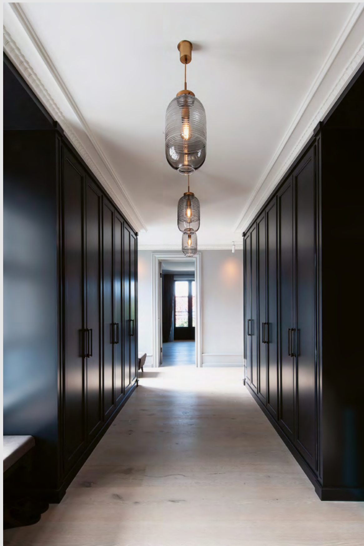
Lantern Collection, Denmark, Interior in cooperation with our partner Anker & Co