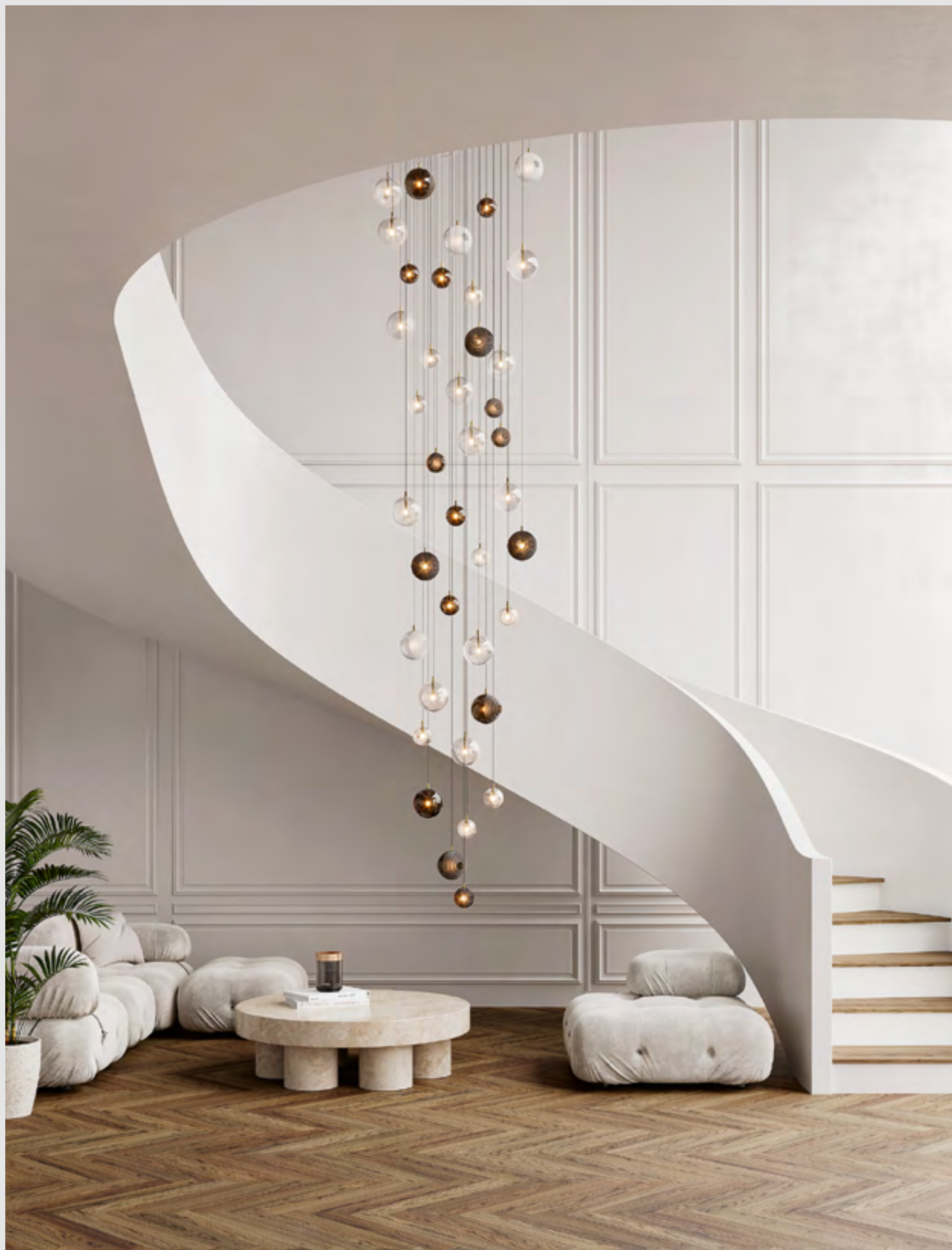
Dark & Bright Star installation of 88 pieces, Interior by AR Visual