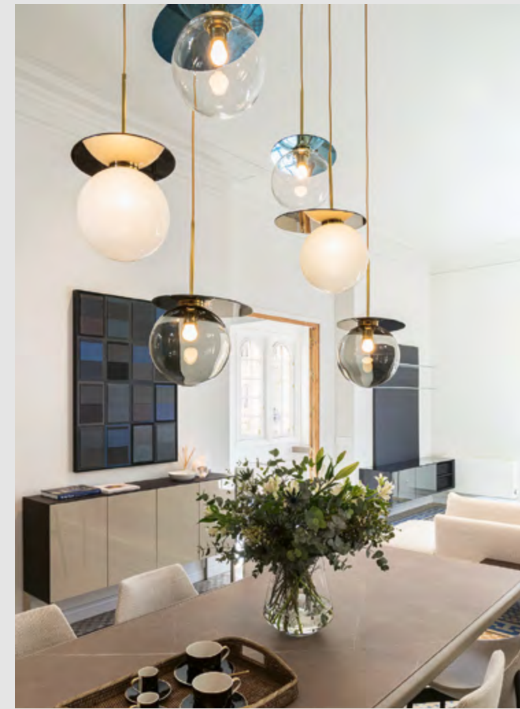
Dew Drops Collection , Interior by Monument Office