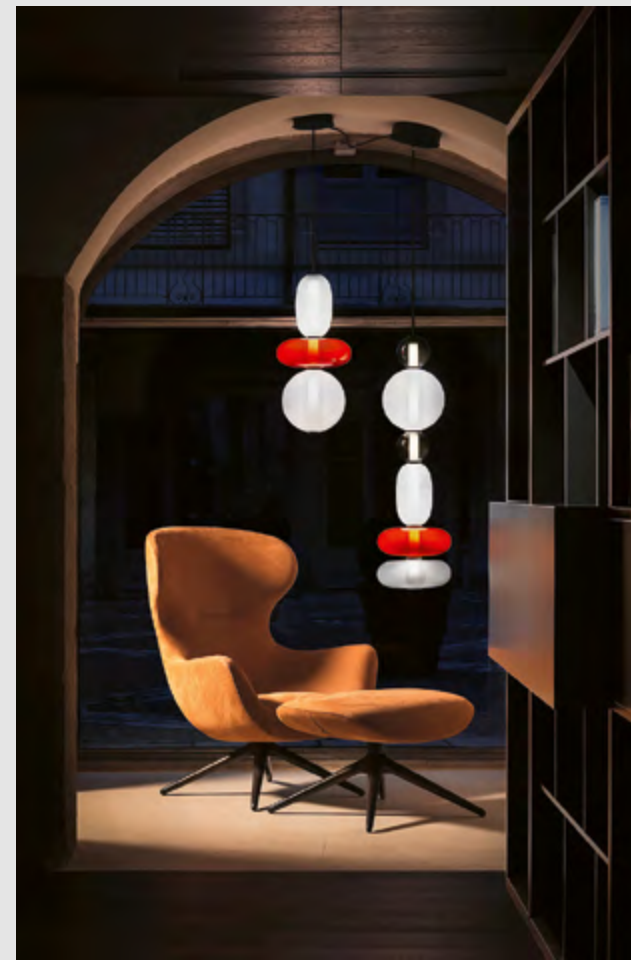
Pebbles Collection , France, Interior by Poliform