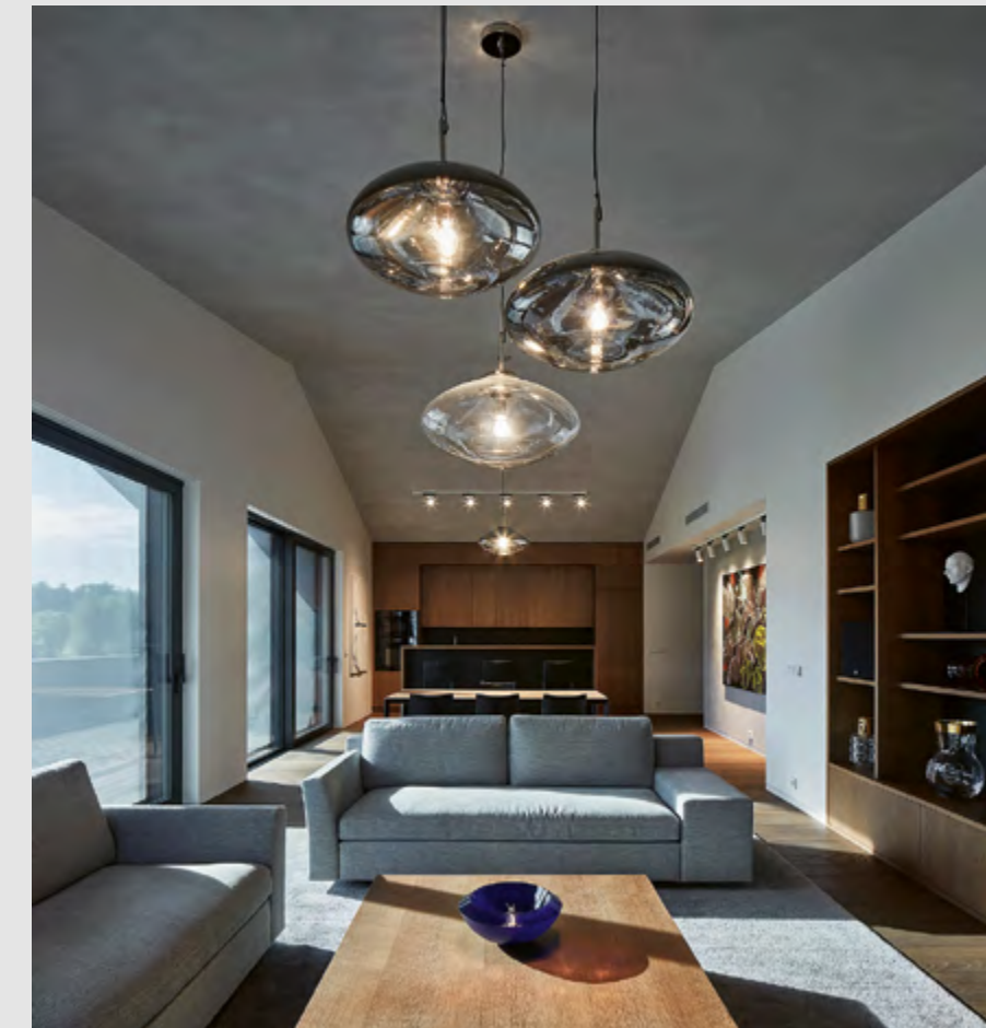
Disc Collection , Czechia, Tee House, Interior by CMC Architects