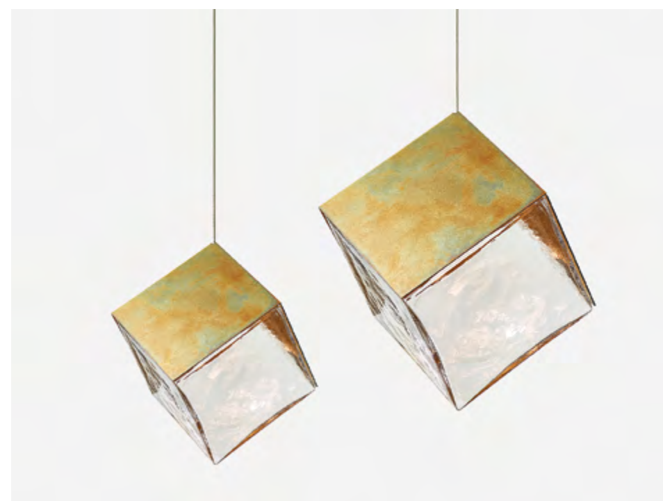
Glass Color: Clear Mounting Finish: DeOpale Brass