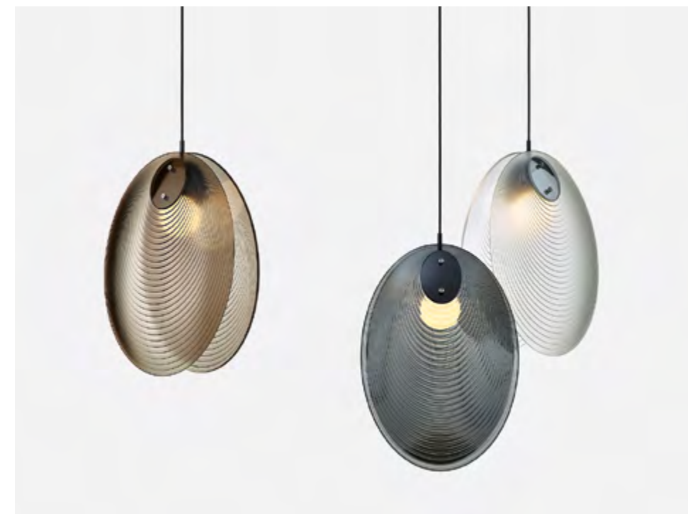
Glass Color: Clear Matte, Smoke, Bronze Matte Mounting Finish: Black