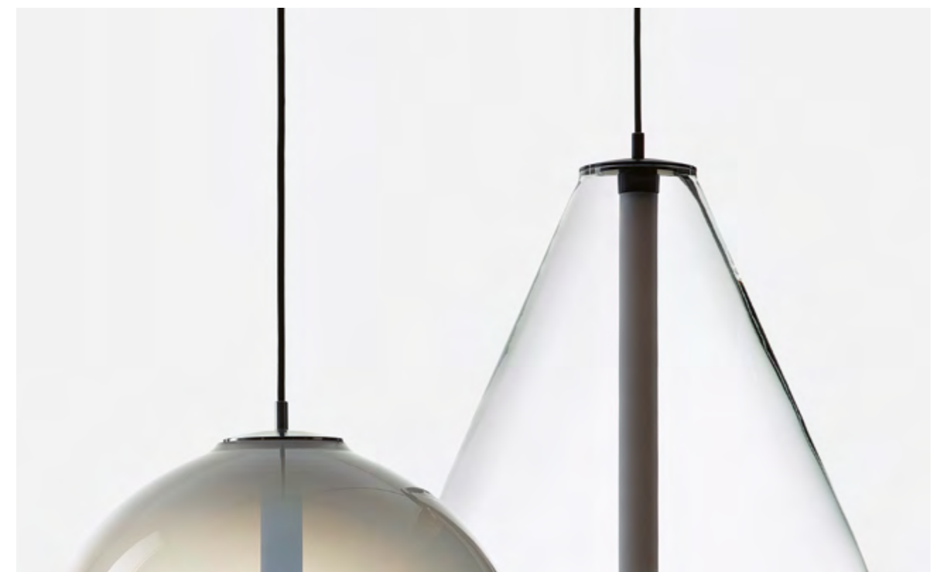
Glass Color: Clear, White, Smoke Mounting Finish: Black, Silver