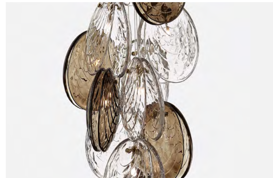
Glass Color: Clear, Alabaster, Dark Pearl, Pearl, Smoke Mounting Finish: Anthracite, Brushed Gold