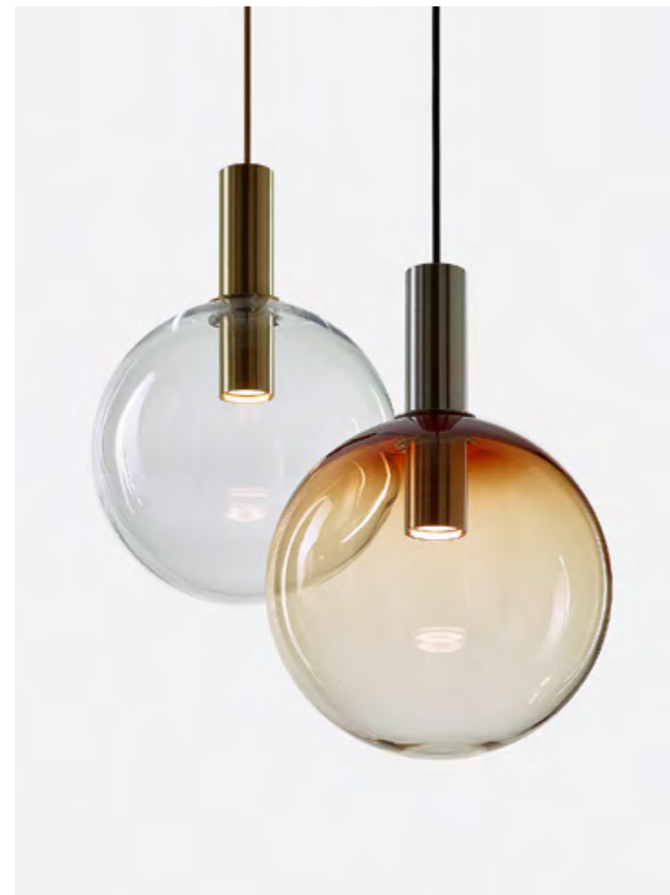
Glass Color: Clear, White, Smoke, Red Orange, Plum Mounting Finish: Brushed Silver, Brushed Gold